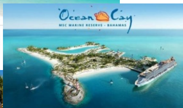
OCEAN CAY MSC MARINE RESERVE